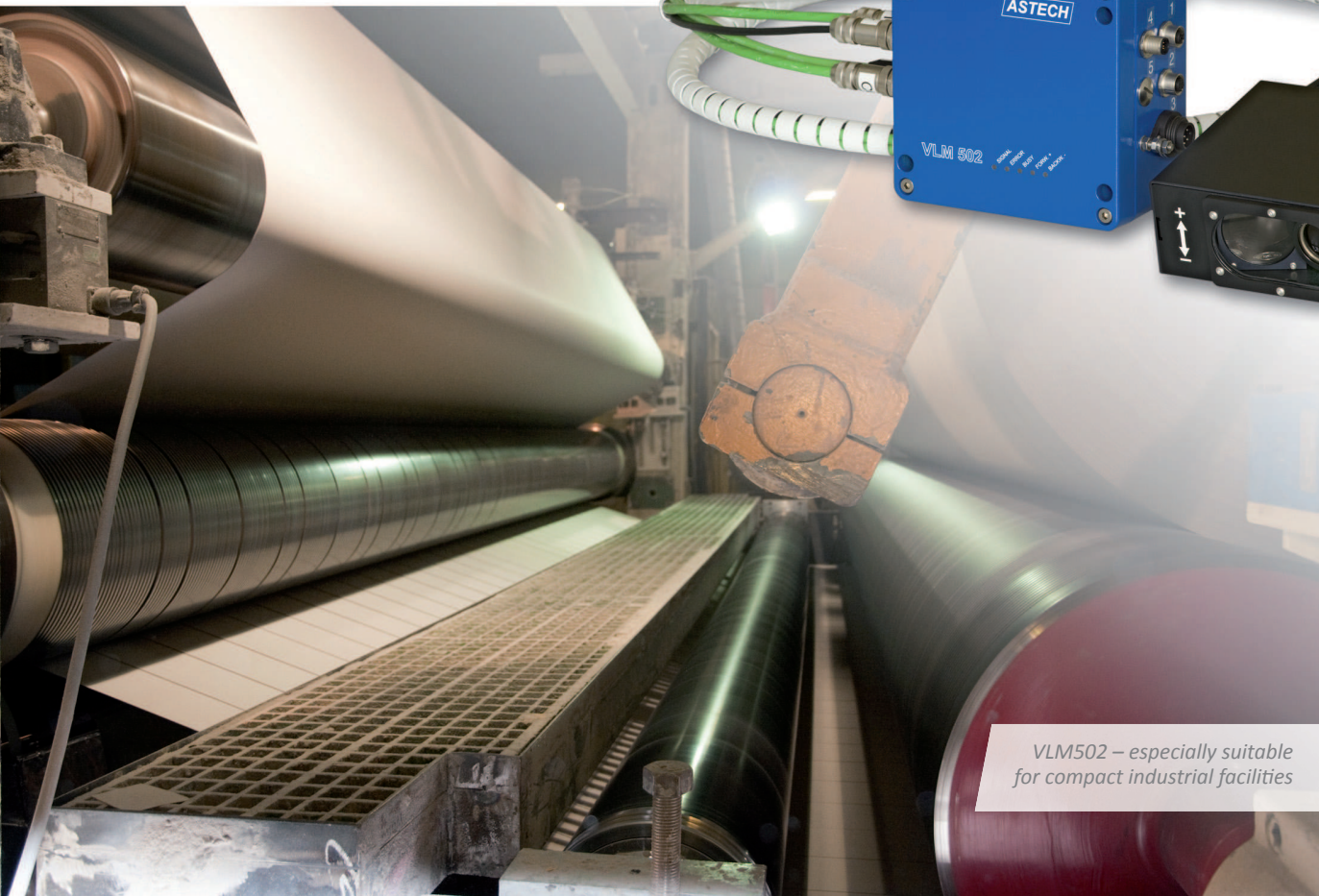
VLM502 – especially suitable for compact industrial facilities