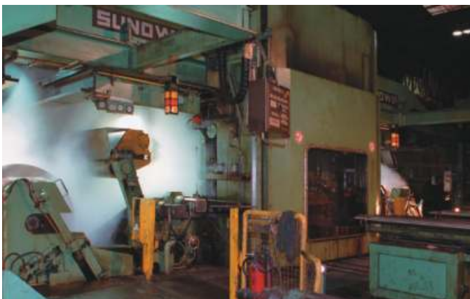
Rolling mill at 800 m/min, left side

Two multifunctional yokes were installed, one on the run-in and one on the run-out side. The combination of non-contact measurement