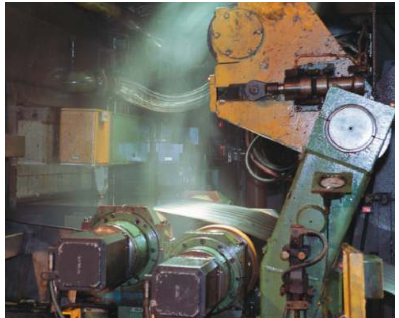
C-frame for thickness- and speed measurement, right side

In strip rolling, maintenance of the thickness tolerance of the end product is the decisive quality characteristic. In new equipment installation or modernisation projects, technological regulation by the mass-flow principle is used almost exclusively. Highly accurate thickness measurement and reliable, slip-free speed measurement are the prerequisites for implementing this modern control concept. Now, for the first time anywhere in the world, both thickness and speed measurement are combined in a compactly built measurement C-frame supplied by the Company IMS.