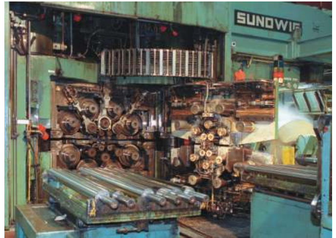
Roll replacement at the SUNDWIG 20-roll stand

High-speed hardware enables the synchronisation of several units with the least possible lag, and so offers a guarantee of the highest precision, especially during acceleration stages of the strip. The use of highly integrated chip configurations gives a further advantage: the sensor, signal processing and a wide variety of interfaces can be combined in a single, compact and robust housing.