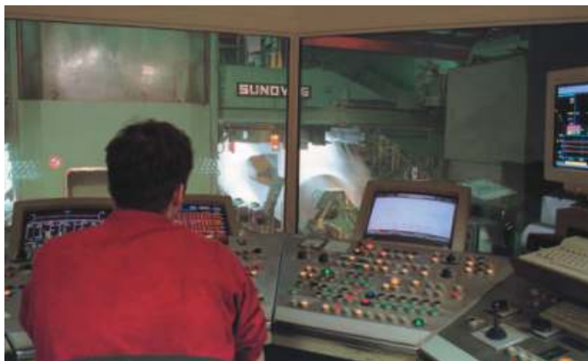
Control room of rolling mill no.3 at KTN Dillenburg

The thickness measurements work on the principle of transmission through the material. An X-ray or isotope beam coming from an emitter passes through the object being